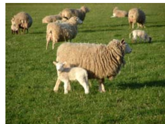
Rushall lambs in 2005

We have two new cuts of organic lamb in the freezer: Best End Cutlets (ideal for Lancashire Hotpot) Noisette Joints—these are boned and rolled, and can either be cooked whole as a joint or cut into individual noisettes.