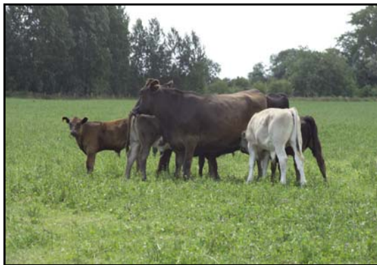
Beef cow suckling calves at Marcham 2005

We have had a long, cold and dry winter, and we are now looking forward to some warm and wet weather to get our crops going. As soon as possible we want to get our beef and dairy animals outside grazing the organic grass fields.